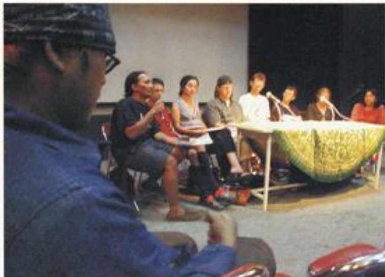
14 CAMP ARRIVED IN BALI PRESS CONFERENCE AND DISCUSSION AT LIP YODIMARTIA